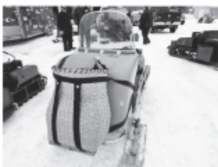
Above: Trailmaker packed & ready to go

On February 11, eighteen antique, rear-engine, snowmobiles pulled out of the Museum parking lot for day one of the 100-mile challenge. Also in the group was a modern support sled and in the front was our fearless leader on a 4-stroke vintage Arctic