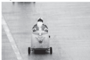
Santa on the Oldest Snowmobile