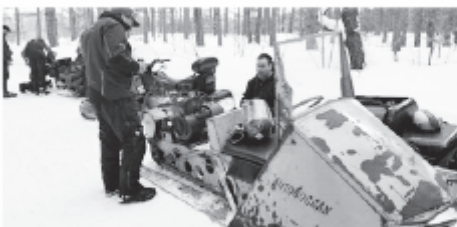
Some needed repairs on the trail