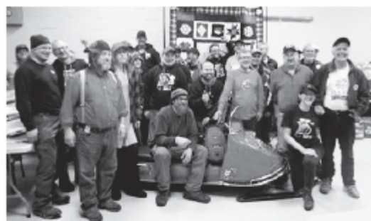
23 Boa Ski Brothers & Sisters