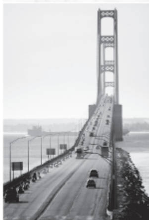
Bridge photo courtesy of Beau Vallier