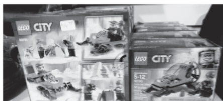
Lego Snowmobile Sets