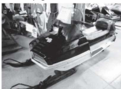
1976 Arctic Cat Cheetah