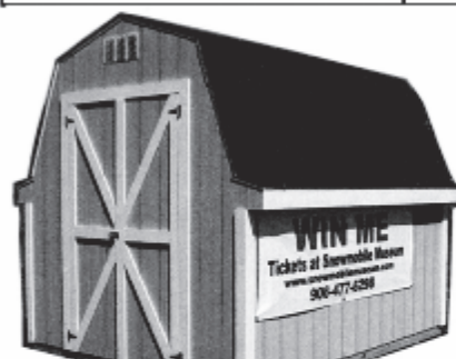
September 2020 Swap Meet Raffle See page 4 for information

Friday concluded with a Night Ride to the Millecoquins Bridge on the Pipeline and a bonfire. Almost 90 went on this ride and everyone