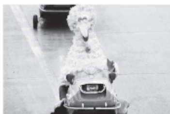
Big Bird, Best Costume