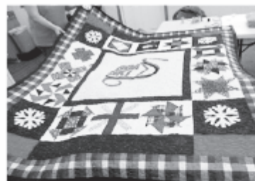
Boa Ski Quilt donated by local Northern Neighbors Quilters