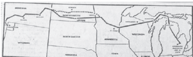
1979 Map of the Fisher's trip to Yellowstone