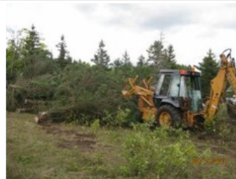
Left: Cutting the trees on the new Museum property

We will post updates on the project on our website, on the Home page under Building Fund. In the near future we will have a New Building page. If you are interested in helping or contributing in any way, please contact Marilyn at the Museum.