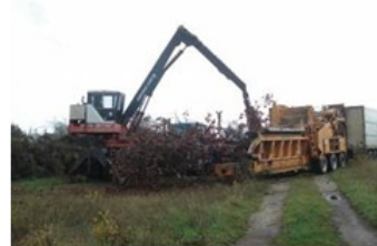
Left: Chipping the trees

With all of the donations we have received of memorabilia, money, and snowmobiles, we realize this has become a project of love and memories made by so many people. It is definitely not "our" museum, but "your" museum. As you