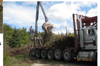
Right: Hauling the stumps